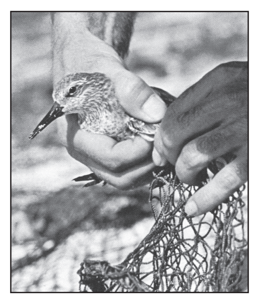
A worker frees a knot from a cannon net.

4 The bird we know as B95 was among 850 red knots caught that day. His now-iconic black band was applied to his lower right leg by a shivering worker with stiff fingers and an aching back. Of the hundreds of knots that received black bands in the trucks that day, he is the lone survivor that scientists can identify. Records show that this knot had adult plumage even then, which means he had to have been at least three years old in 1995, and could have been older.