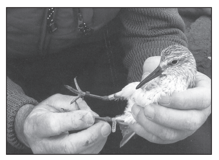
B95, as he appeared in his gray nonbreeding plumage at Rio Grande, November 8, 2007