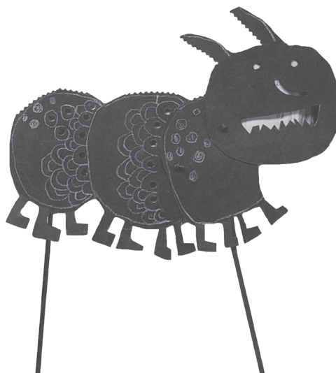
an Indonesian rod puppet