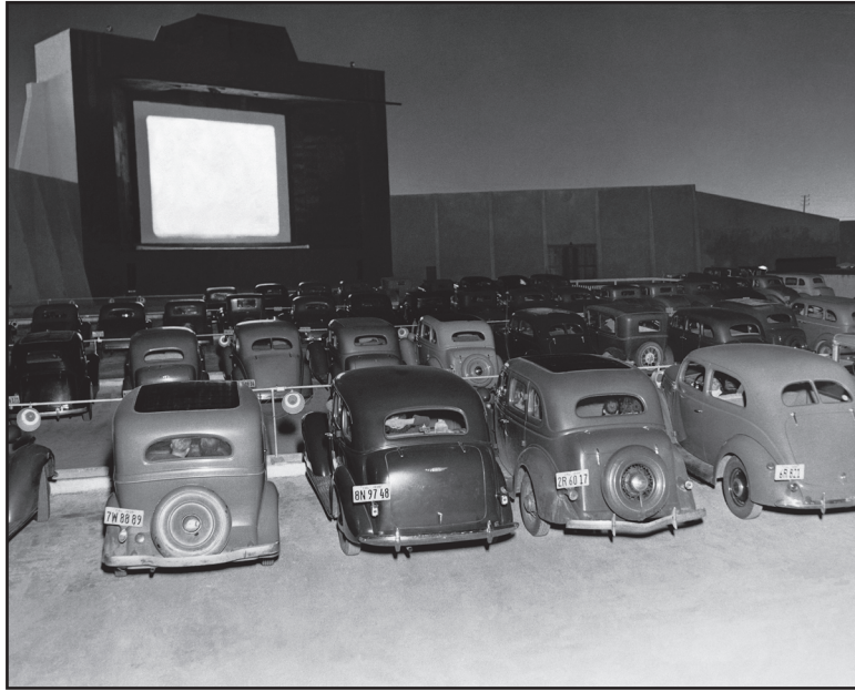
a typical drive-in theater of the time