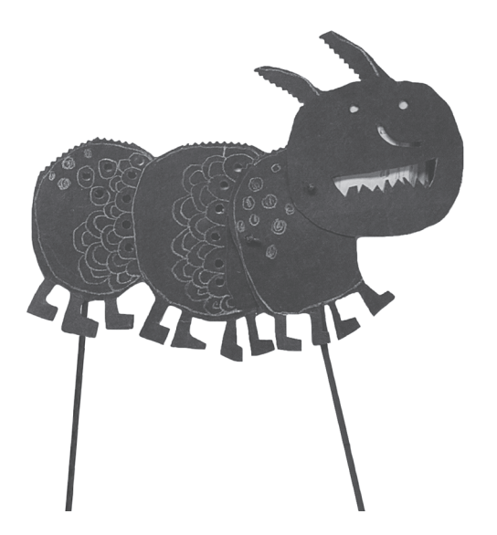
an Indonesian rod puppet